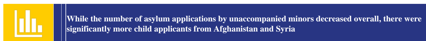
Figure 4.26: Number of applications by unaccompanied minors by Top 10 countries of origin, 2020 compared to 2019

applications by Afghan minors were concentrated in these three countries.