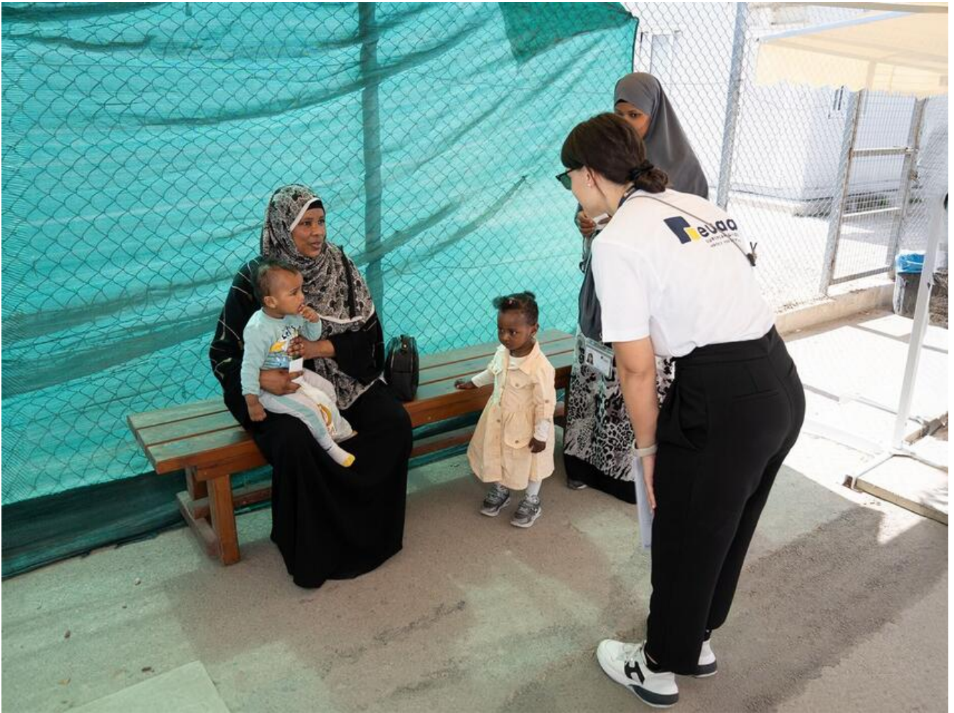
Download the image [JPG]