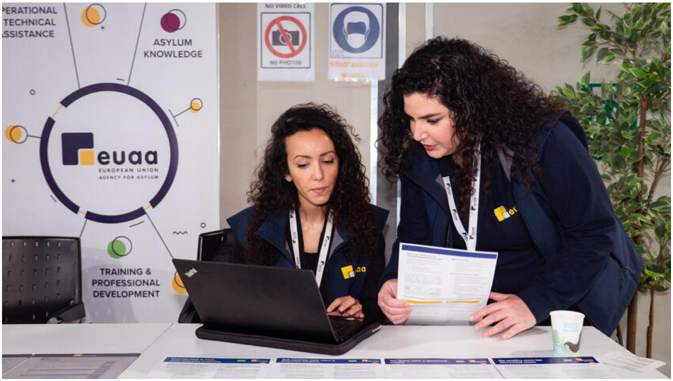
Download the image [JPG]