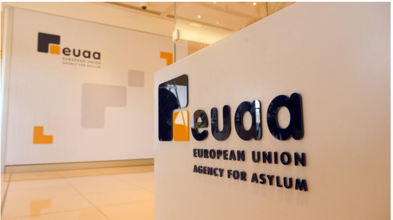
Download the image [JPG]