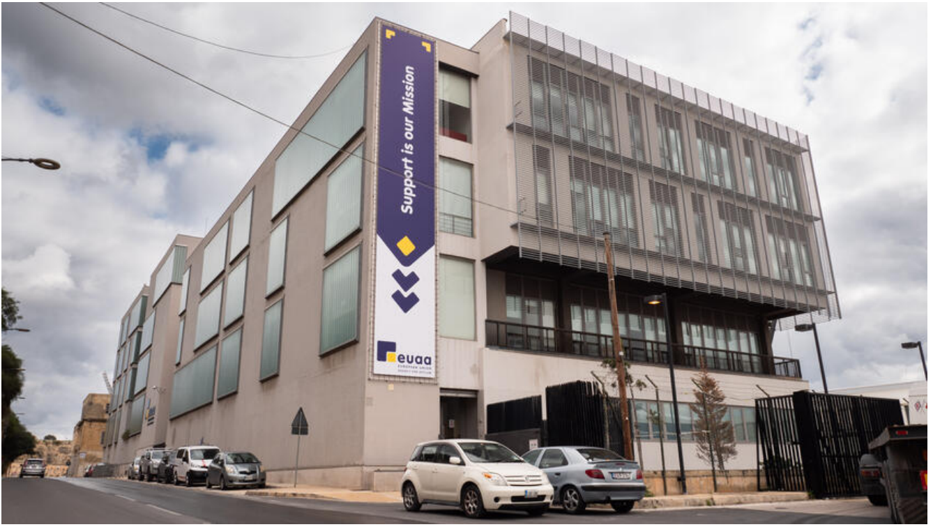
Download the image [JPG]