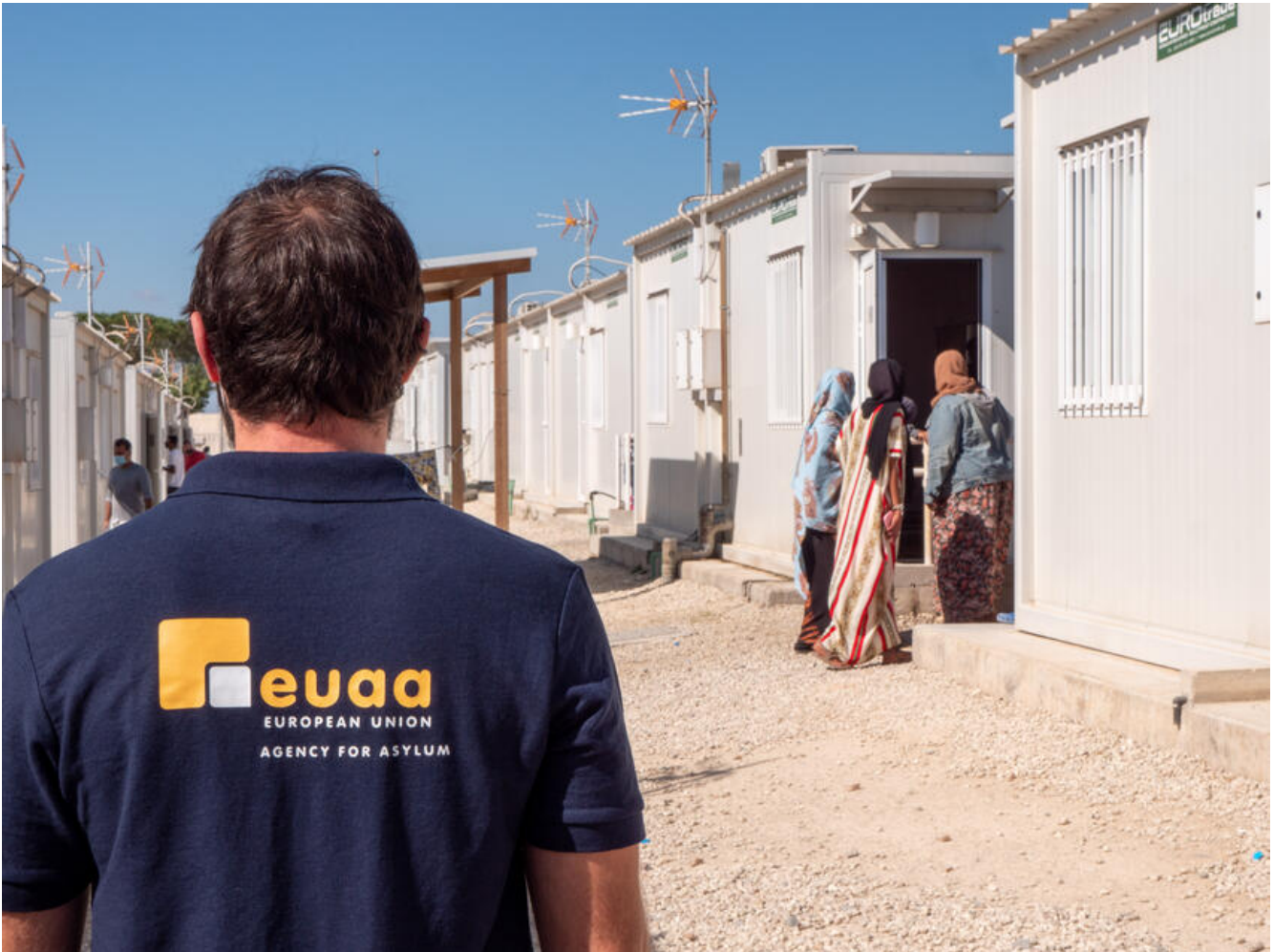
Download the image [JPG]