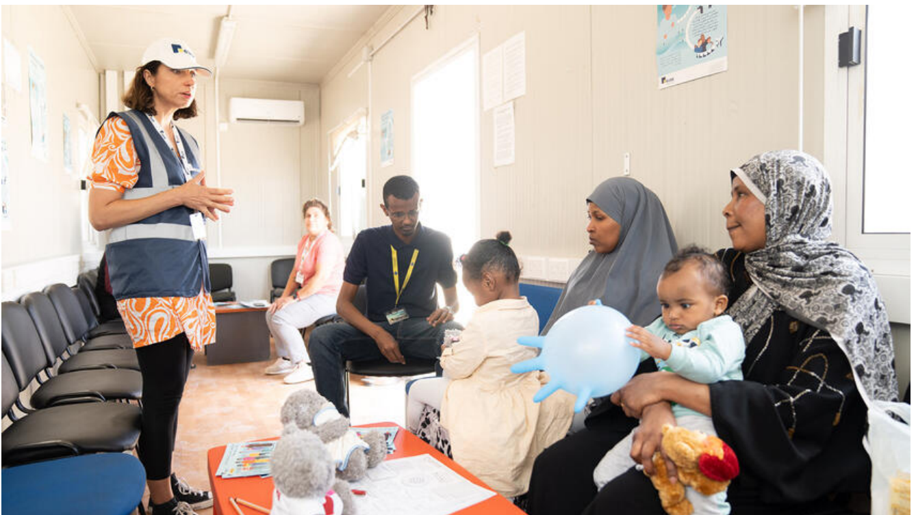
Download the image [JPG]