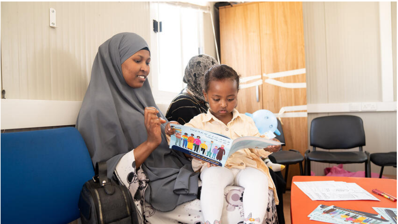
Download the image [JPG]