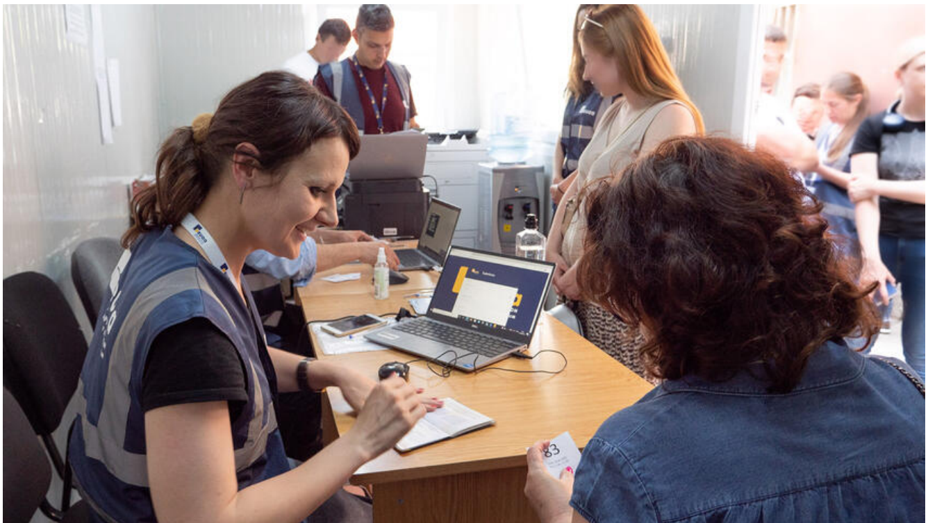
Download the image [JPG]