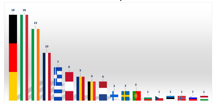
The EUAA Judicial Experts' Pool

With the support of the Courts and Tribunals Network, the EUAA has supported the development of tailor-made materials 'by judges for judges'. You can find the catalogue of the EUAA judicial publications (and their translations) here.