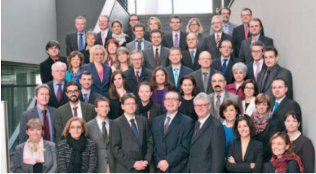
10th EASO Management Board meeting, Malta, 4 and 5 February 2013