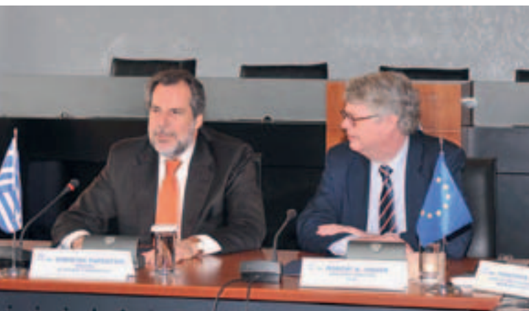
Signing of the Operating Plan with Greece, Athens, 1 April 2011

Following a request made by the Greek government, in February 2011, EASO agreed to support Greece with its establishment of the new Asylum Service, First Reception Service, Appeal Authority, and reception in general and reduction of the backlog via the deployment of experts from the different EU Member States via the so-called ASTs. In the first phase of the support to Greece, ending March 2013, EASO deployed and managed 70 experts from 14 Member States. These experts made up 52 ASTs. Following a request made by the Greek government in early 2013 for further support, EASO continues to support Greece until December 2014. In this second phase EASO supports Greece via the deployment of ASTs, which provide training on nationality establishment (in close cooperation with Frontex) and support on EU funding, support on the collection and analysis of statistical data and support in the field of COI. Depending on the request by the Greek government, EASO can rearrange or step up its operations.