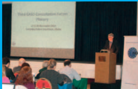
3rd Consultative Forum, Malta, 27 and 28 November 2013

The EASO Consultative Forum is a continuous two-way dialogue that allows for the exchange of information and pooling of knowledge between EASO and civil society.