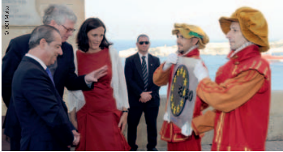
Unveiling the EASO logo, inaugural ceremony, Valletta, 19 June 2011