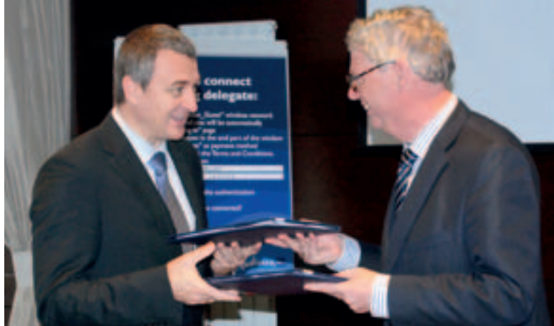
Signing of the Operating Plan with Bulgaria, Bucharest, 17 October 2013