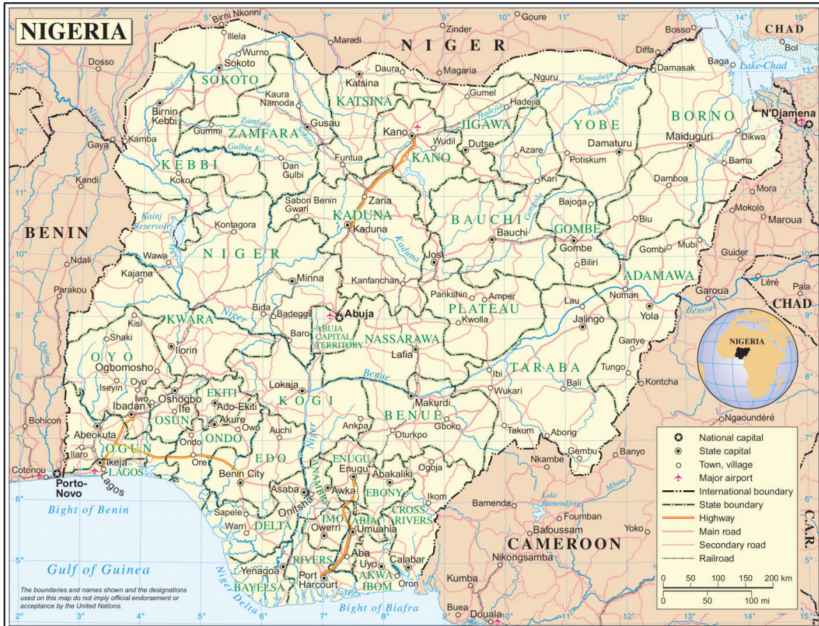
United Nations Map No. 4228 Rev. 1 August 2014 (16) .