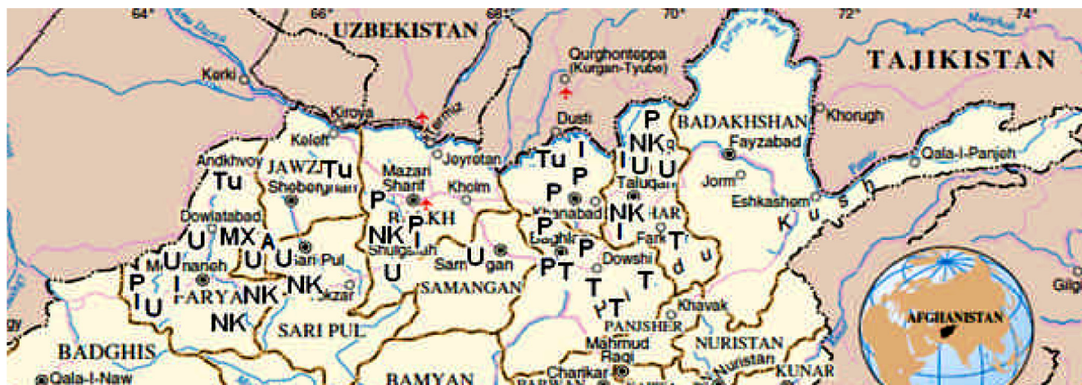
Figure 4: Ethnic composition of known Taliban fronts in the north

During the Danish Immigration Service's fact-finding mission in Afghanistan, 25 February to 4 March 2012, the Afghanistan Independent Human Rights Commission (AIHRC) stated that in non-Pashtun areas, the Taliban would often ask the community to join them or in poor areas individuals would be offered money to fulfil tasks for them (170) . A contact in Afghanistan pointed out that where other ethnicities than the Pashtun were recruited, financial incentives are often key (171) . When insurgents try to reach out to other ethnicities than the Pashtun, religious motives as well are important as a mobilising factor (172) .