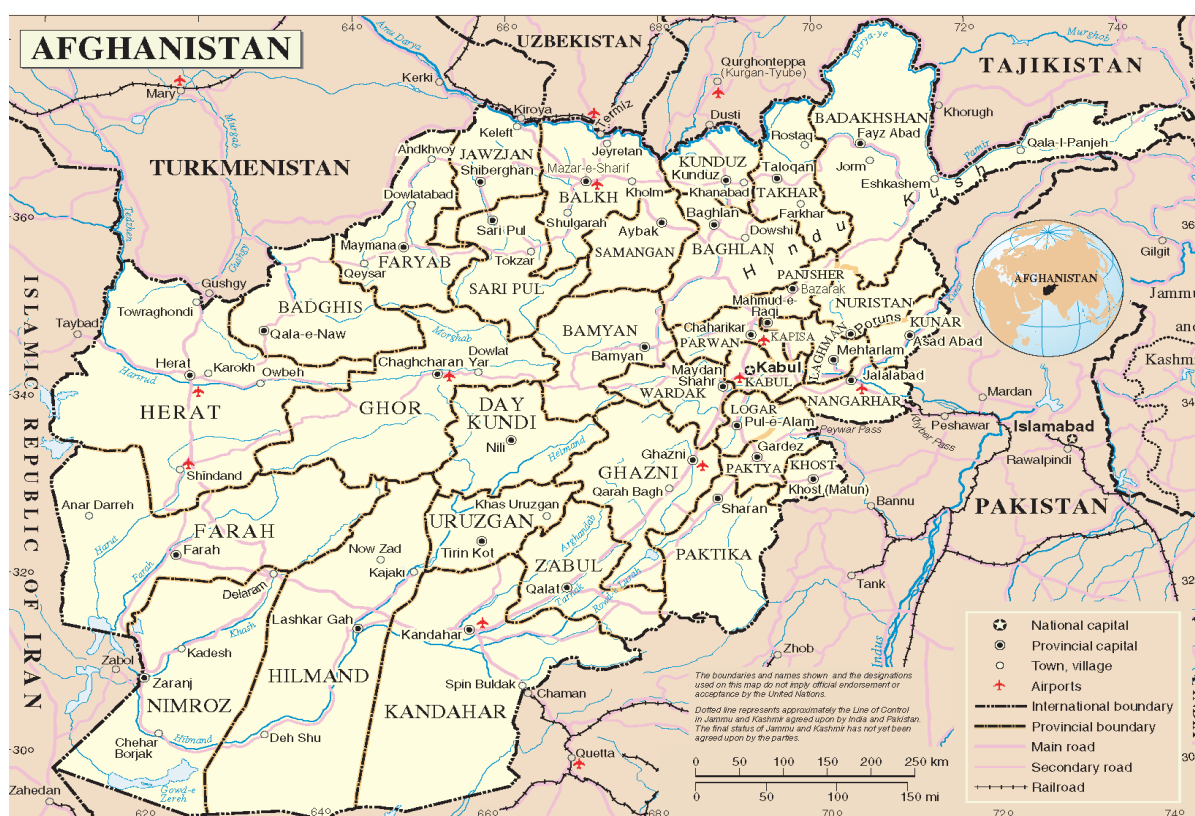
Figure 2: Provinces in Afghanistan