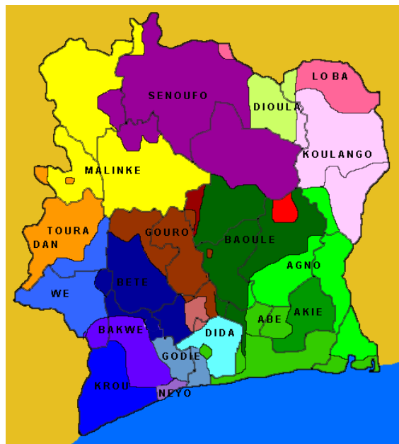
Map 2 The main ethnic groups of Côte d'Ivoire ©Etienne Ruedin [CC BY-SA 3.0] 25

The main cultural clusters are divided into 5 groups: 26