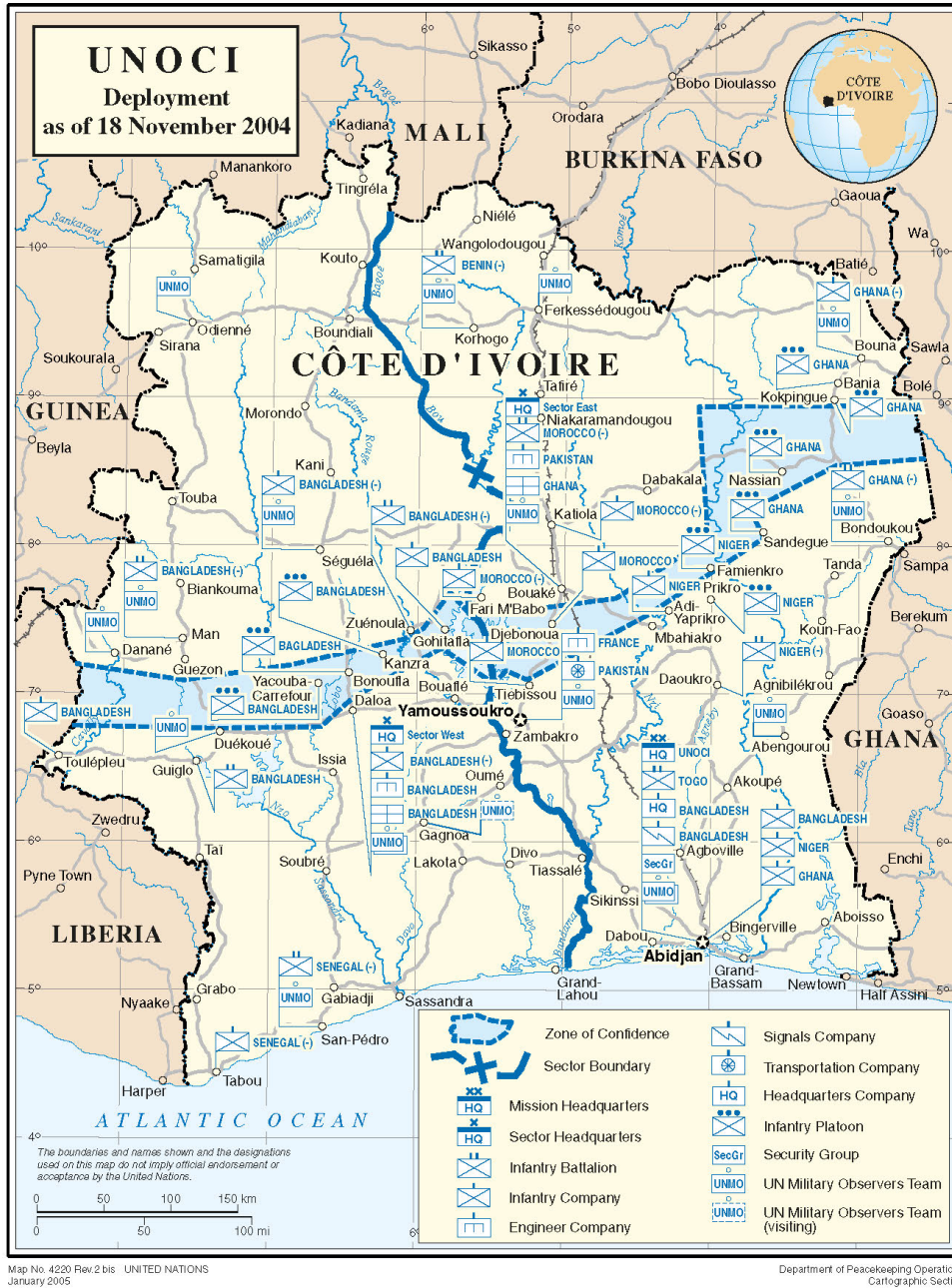
Map 3: UNOCI, Côte d'Ivoire, 18 November 2004, © UN 112