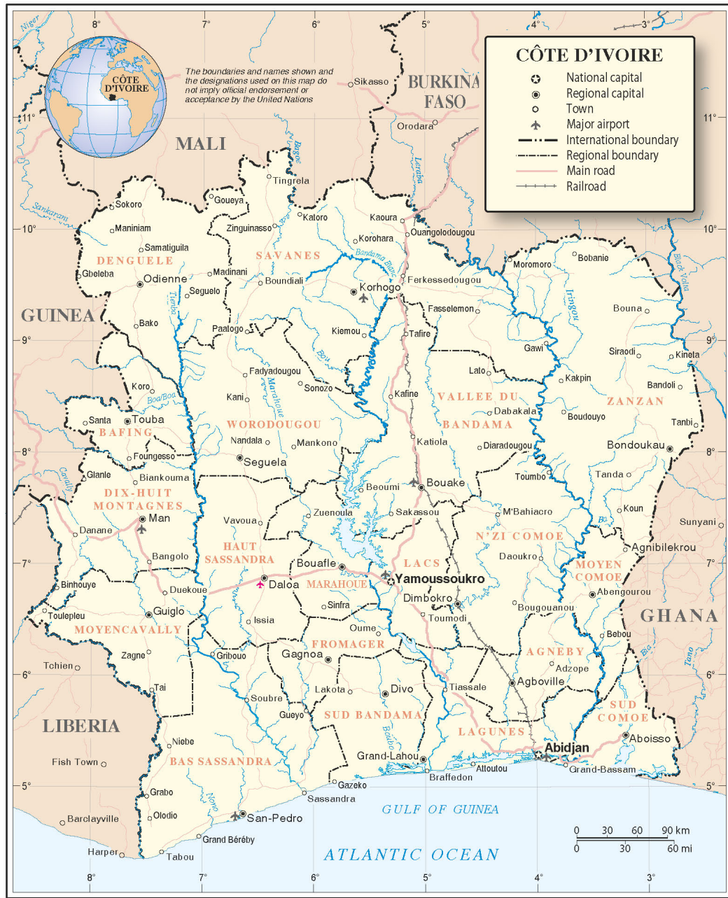
Map 1 Côte d'Ivoire, December 2011, ©United Nations 3