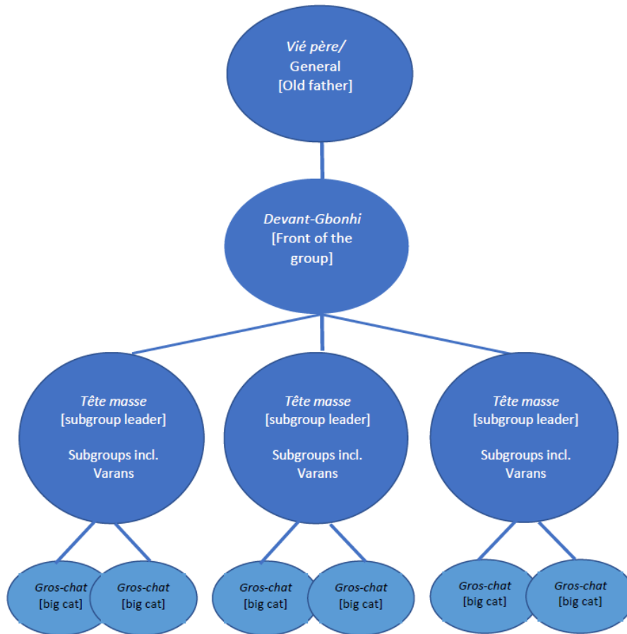
Figure 2 Structure of a Microbe group

Microbes operate in groups; predominantly at night in neighbourhoods they know well 473 , hence Abobo, Anyama, Attécoubé, Adjamé, sometimes also Yopougon or the outskirts of Cocody. 474 Their usual modus operandi is the following: they enter a busy street in a large group and make a lot of noise, simulating fights between them or with a rival gang. Then, very quickly, they steal everything possible from everyone on their path before withdrawing in an organised way. 475 Another tactic of them is to pretend to beg for food or money in order to stop passersby, quickly surrounding them and robbing them. 476 Their weapons are mostly machetes, knives, sticks or other blunt objects 477 , rarely