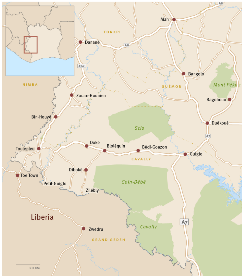
Map 4 The protected forests of Western Côte d'Ivoire, © Human Rights Watch, June 2016 645

In 2013, the transitional period of the rural land law was extended by 10 years before the State can exercise its pre-emptive right on 'land without owners'. 646 Four million plots remained to be identified (representing as many land titles to be issued) and 10 000 rural villages to be delimited out of 11 000. 647