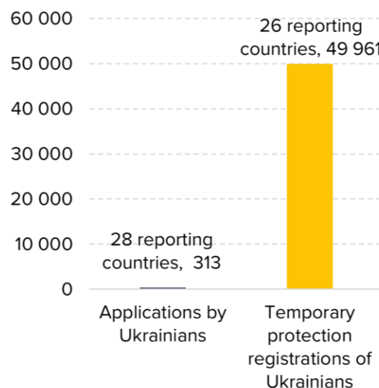
Figure 1: Asylum applications and registrations of temporary protection for Ukrainians, week 21 2022

The Council of the EU adopted an implementing decision activating the temporary protection directive (TPD or 2001/55/EC) on 4 March. 10 Since then, EU+ countries have been adopting the necessary national legislation to ensure adequate implementation, 11 configuring electronic systems and gradually reporting to the EUAA. However, data on registrations for temporary protection are still incomplete. Registrations