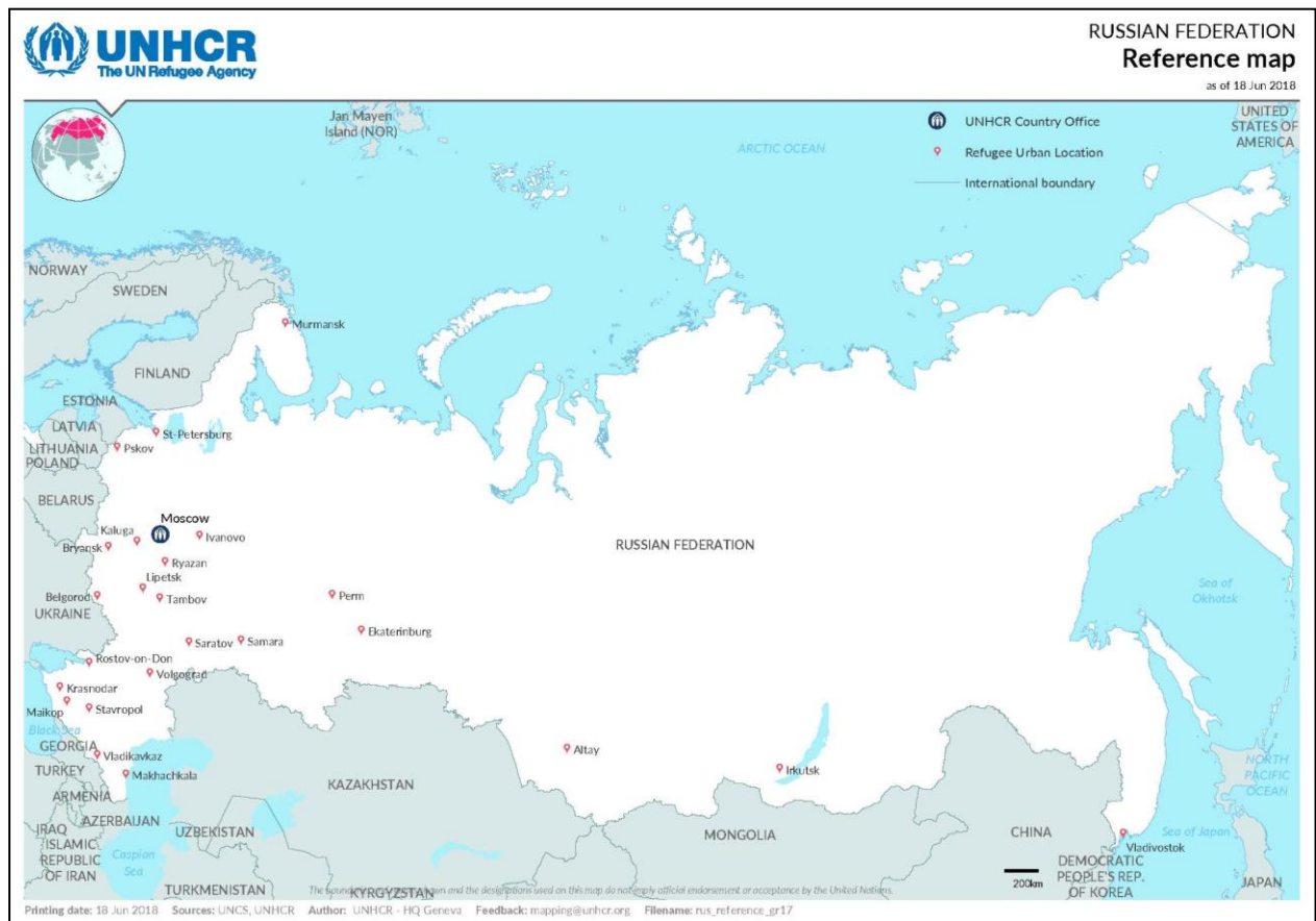
Figure 1: Map of the Russian Federation 8