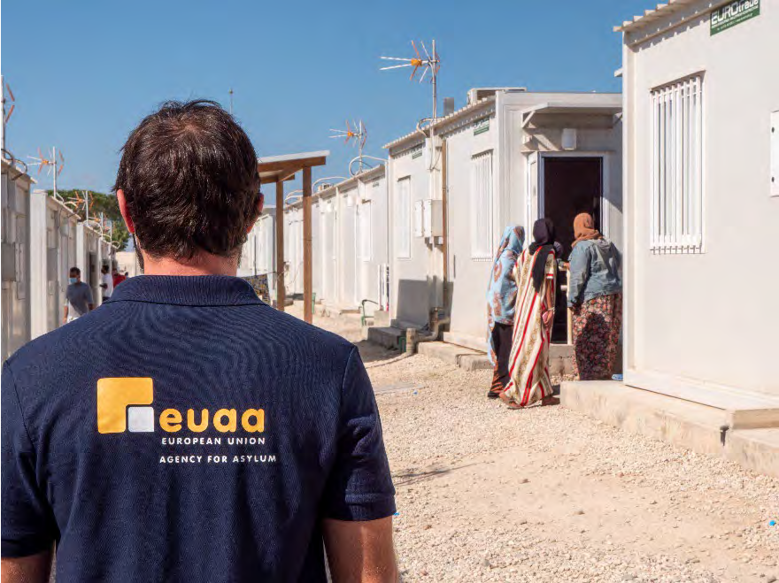
Photo: EUAA personnel in Pournara reception centre in Cyprus