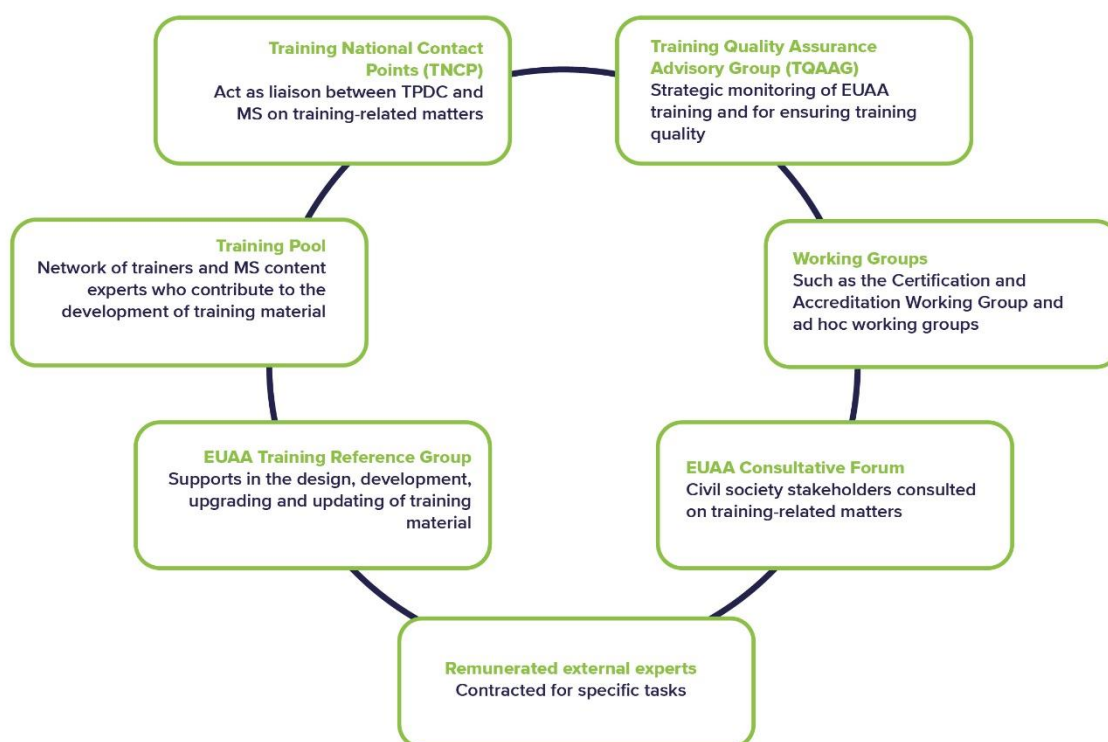
Figure 2: Advisory and working groups

A key strength of the EUAA's approach to training is the inclusion of the expertise of the EU Member States and associated countries, which are the main beneficiaries of the training, across all processes relating to the design, development, delivery and evaluation of the EUAA's training. As an organisation, the Agency fosters an open dialogue with civil society stakeholders through the Consultative Forum. In addition, there are further groups or panels of experts who work directly with the TPDC, as detailed in Figure 2 below.