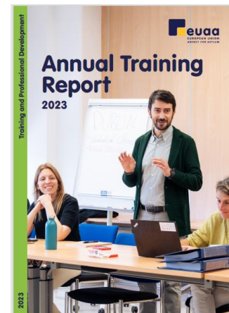
Figure 4: EUAA Annual Training Report 2023

We will continue to identify training needs and implement training activities, including as part of operational plans signed with Member States subject to disproportionate pressure. We will work to enhance cooperation and exchanges with Member States on training and professional development. We will also continue to train officials and build capacity outside Europe. Training support in partner third countries is aligned with our external cooperation strategy . Our annual training report will again provide a comprehensive update on outcomes achieved each year, including 2025 and beyond.