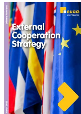
Figure 5: EUAA External Cooperation Strategy 2023

In line with the external cooperation strategy , the development of third country capacities and strengthened, two-way dialogue with civil society are additional priorities.