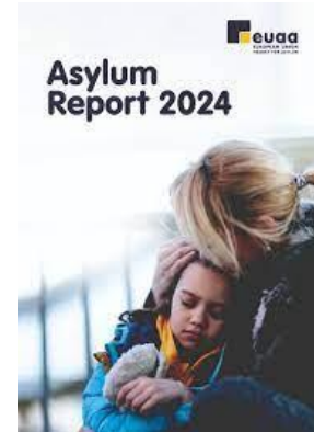
Figure 3: EUAA Asylum Report 2024

We will continue to deliver qualitative and quantitative analyses on asylum and reception, early warning reports and real-time situational awareness and forecasting on the asylum situation, to support decision making in the Member States. Access to our analytical portfolio will be further enhanced through internet portals and databases. The annual asylum report , from 2025 on in a much more streamlined and analytical format than in previous years, provides a comprehensive and qualitative analysis of the state of asylum in the EU.