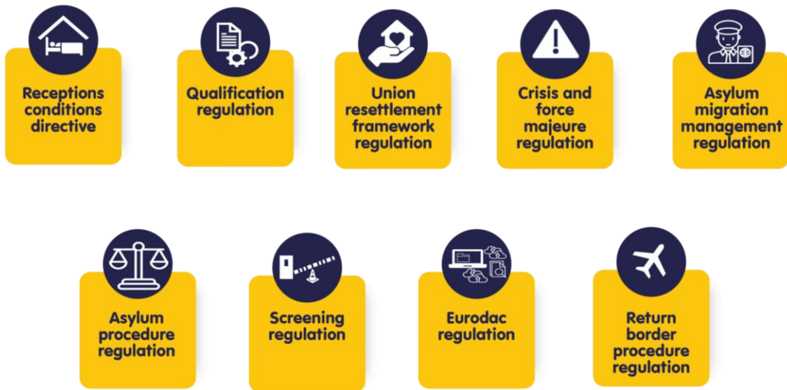
Figure 1. Legislative instruments of the Pact entered into force in June 2024.

Specifically, we will revise and adapt our existing guidance, training modules, tools and products on asylum and reception to the Pact. We will review certain operational standards and indicators and develop new ones as needed.