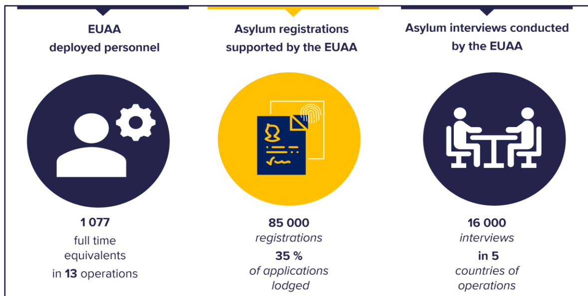
Figure 1. EUAA operations in 2024

The Agency operated in key asylum areas such as reception, relocation, temporary protection, assistance to unaccompanied minors, capacity building and procedural quality. Support to the asylum procedure intensified: compared with 2023, the number of registrations and interviews increased by 21 % and 45 %, respectively.