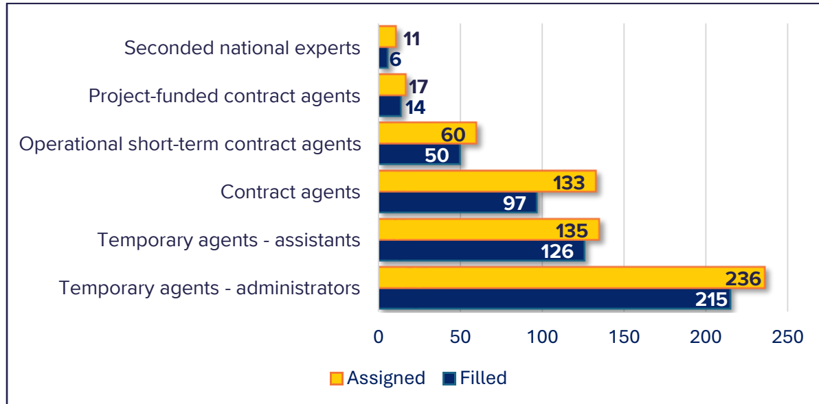
Figure 4. Assigned and filled staff posts per category in 2024

In 2024 the Agency was assigned 592 staff posts, 508 (7) of which were filled.