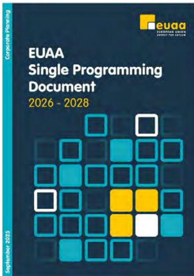
Figure 1: SPD 2026-2028

The Single Programming Document (SPD) is the corporate programming instrument of the European Union Agency for Asylum (EUAA) and serves as the financing decision for the Agency's operational activities. It sets out the Agency's multiannual and annual planning of activities and resources, ensuring coherence between strategic objectives, operational activities and resource allocation.