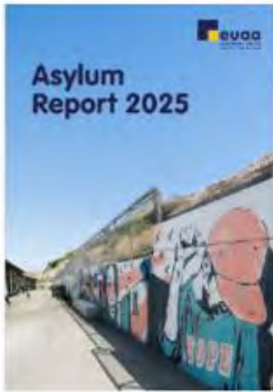
Figure 5: Asylum Report 2025

Through the EUAA's products in the area of asylum knowledge, national authorities are better equipped to increase convergence in international protection decision-making, deliver faster decisions and increase uniformity in reception conditions.