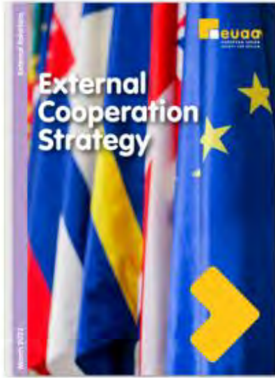
Figure 6: EUAA External Cooperation Strategy

Good governance remains central to achieving administrative excellence. The EUAA will continue strengthening internal control systems, strategic planning and reporting, as well as management and evaluation processes.