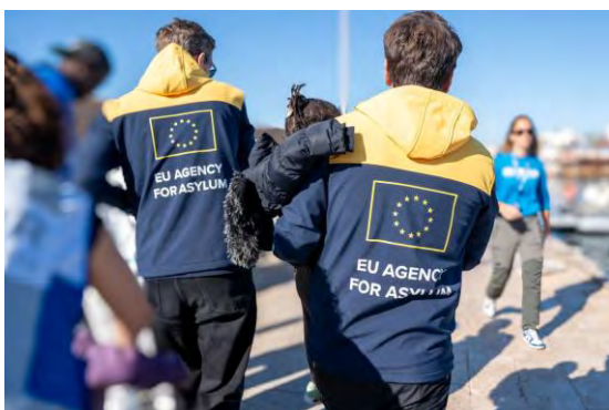
Figure 3: EUAA operational support in Lampedusa

With the adoption of the legislative proposals under the Pact, the Agency is expected to maintain a substantial operational presence while expanding the scope of its tasks within the limits of available resources.