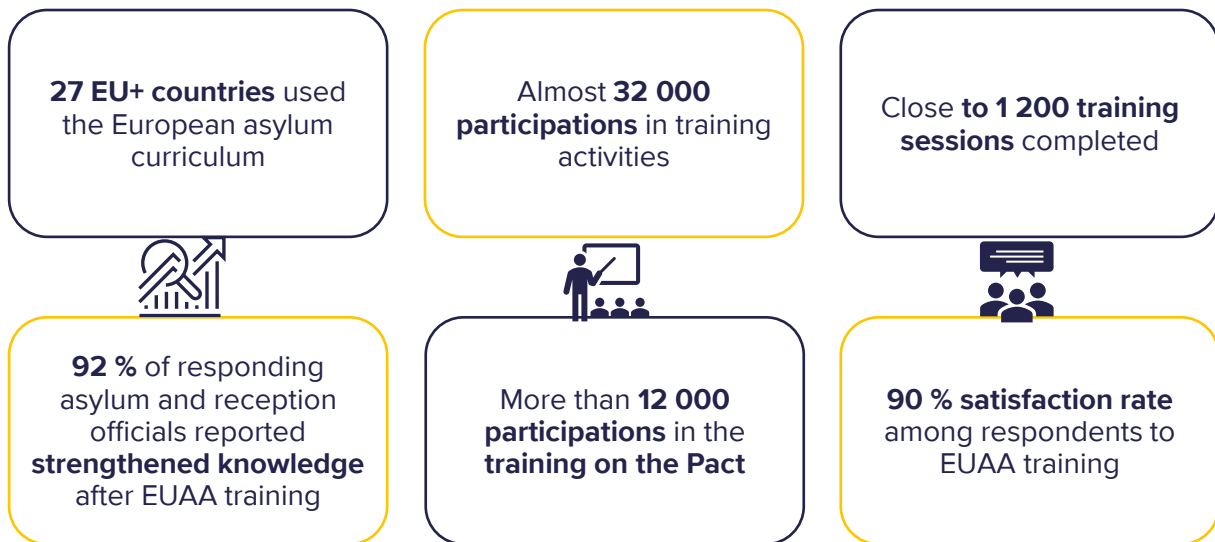
Figure 2. The year in numbers - 2 of 3

In 2025, the EUAA started monitoring the operational and technical application of the Common European Asylum System , in accordance with the methodology established in 2024 . The monitoring mechanism, introduced by the EUAA Regulation in 2022, aims to 'prevent or identify possible shortcomings in the asylum and reception systems of Member States and to assess their capacity and preparedness to manage situations of disproportionate pressure ...' (2) .