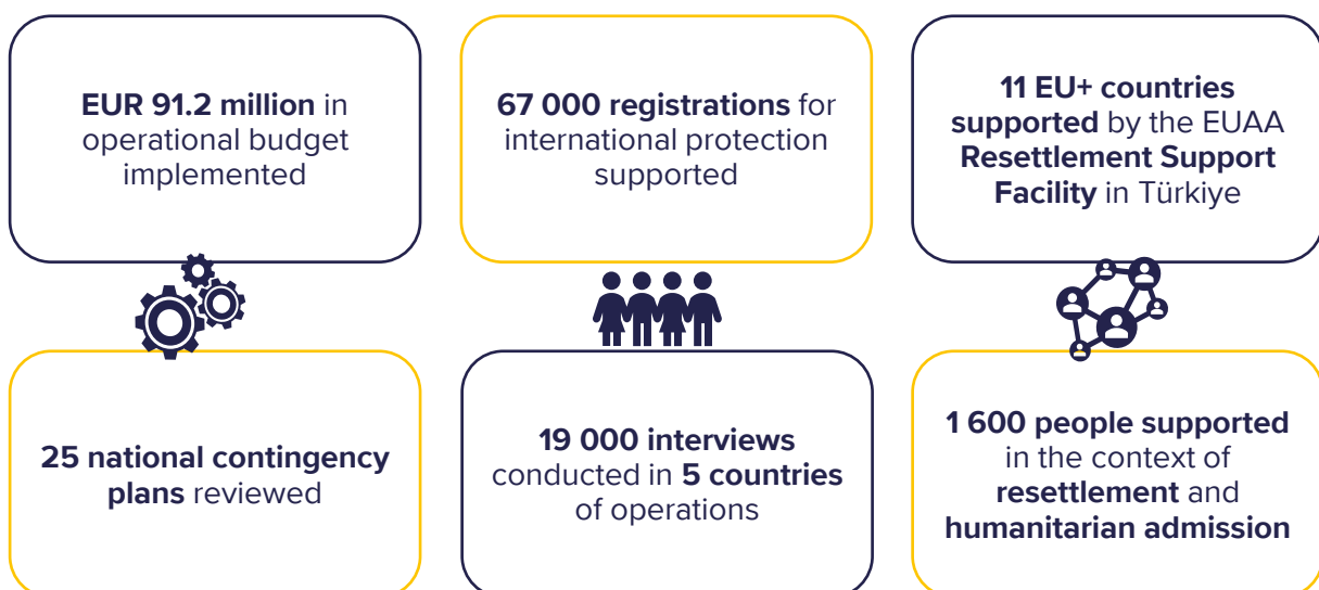
Figure 1. The year in numbers – 1 of 3

Against this backdrop, the EUAA signed new operational plans with Ireland and Lithuania and provided operational and technical assistance to 12 Member States through the deployment of close to 1 000 personnel, in addition to 450 interpreters