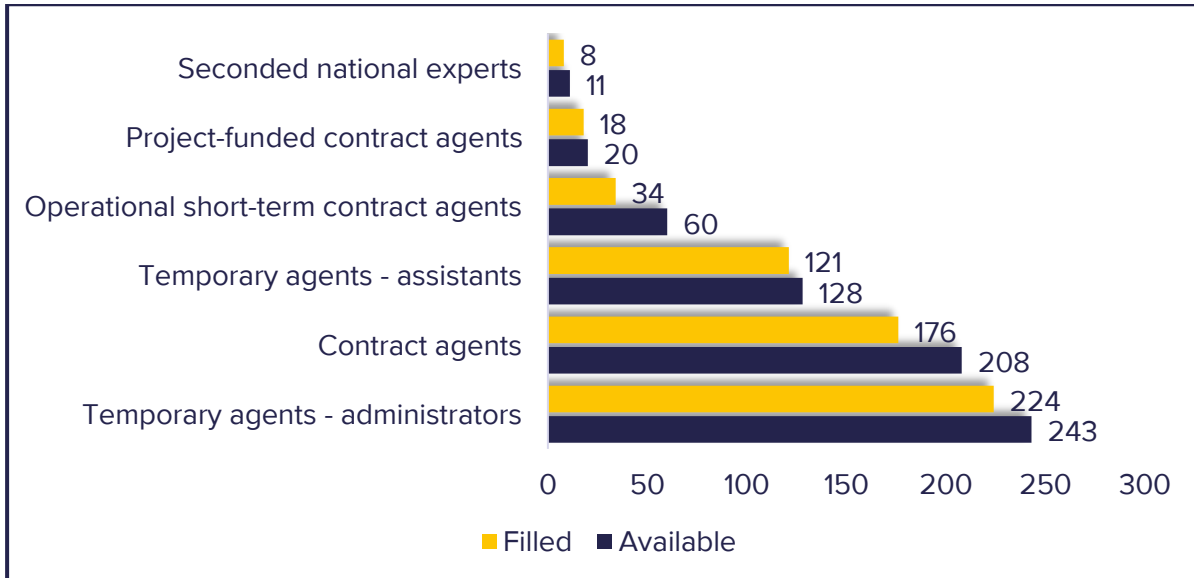
Figure 4. Filled and available staff posts by category as at 31 December 2025

In 2025, the Agency had a total of 670 staff posts available , of which 581 (4) were filled by the end of the year.