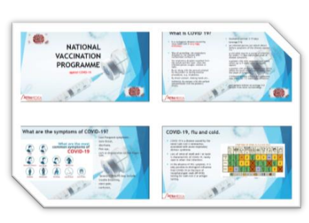
Office for Foreigners in Poland launched an information campaign