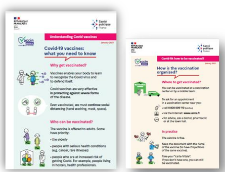
Flyers in France

In this context, countries inform on the relevant process online though dedicated websites (<u>Belgium</u>, <u>Finland</u>, <u>Portugal</u> and <u>Switzerland</u>), and printed material such as posters and flyers (Belgium, France, Netherlands, Poland, Switzerland) in multiple languages.