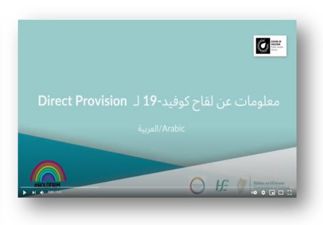
YouTube video in Ireland