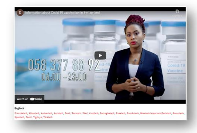
YouTube video in Switzerland

In addition, a television campaign will be broadcasting in five instalments during the first half of the year to raise awareness. The first clip is <u>available in 16 languages</u>.