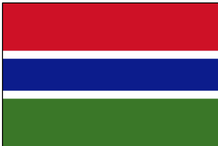
Image 1: The flag of The Gambia (© SEM, Division Analysis, Switzerland).

The geographical features are also reflected in the national flag. Red symbolises the sun, blue the Gambia River, green agriculture, white peace and unity: (10)